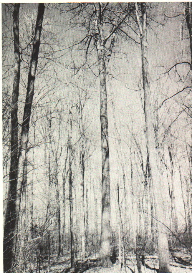
Most forestlands in private ownership are capable of producing high quality timber, however, most are not being managed so maximum production can occur.

You can obtain names and addresses of consulting foresters practicing forestry in Michigan from the local county Cooperative Extension Service office.