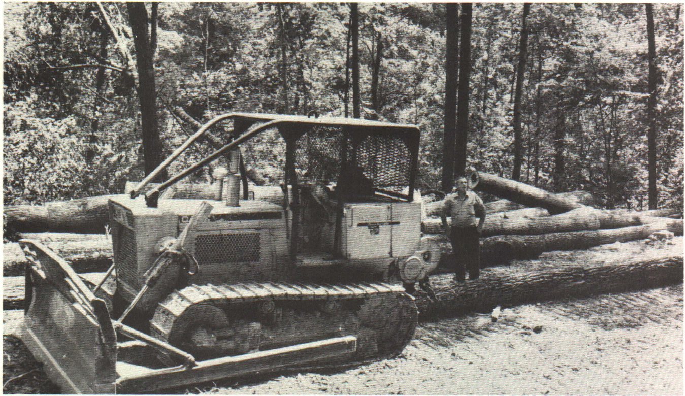
Appropriate equipment is necessary when large amounts of timber are to be harvested. A small bulldozer is well suited for constructing logging trails and skidding logs.