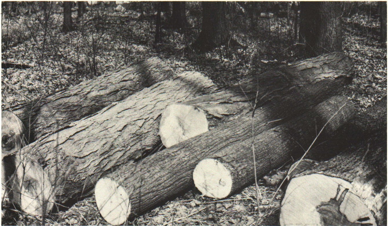
Many woodlands in Michigan can be managed to produce a sustained yield of forest products. Some of these sugar maple logs are of veneer quality.