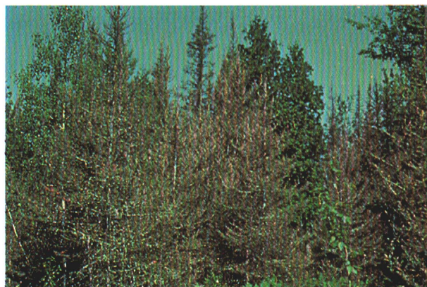
Balsam fir trees killed by spruce budworm feeding. Top-killing usually occurs after about 3 years of severe infestation and tree mortality begins after 5 years.