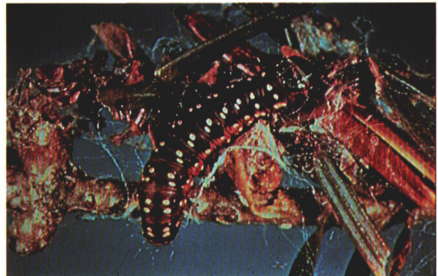
Mature spruce budworm larva. Full-grown caterpillars reach about 1¼ inches in length.

Full-grown caterpillars reach about 1¼ inches in length. Pupation takes place in the feeding shelter