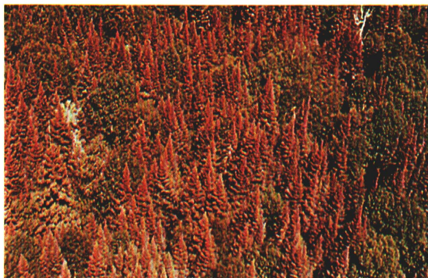
Reddish-brown hue seen in mid-July during a spruce budworm infestation. Needles clipped and webbed into feeding sites turn color creating an alarming appearance of damage.