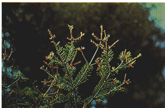
Spruce budworm feeding damage on balsam fir foliage. Caterpillars begin feeding on new shoots but will also move to old needles if new shoots have been exhausted.

If it is decided that chemical control is feasible, then aerial application of a registered biological or chemical insecticide is the most efficient method. Some materials currently registered for control of spruce budworm are Thuricide, Dipel, Sevin 4-oil