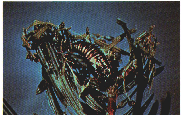
Spruce budworm pupa. Pupation takes place in the feeding shelter in late June and early July.