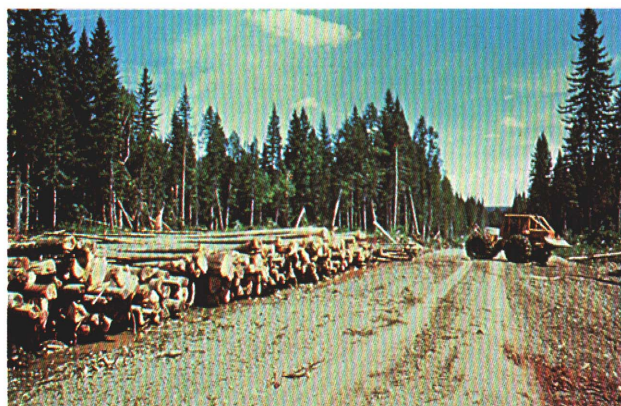
During a spruce budworm outbreak salvage logging is an excellent means of protecting investment dollars and reducing spruce budworm outbreak potential.