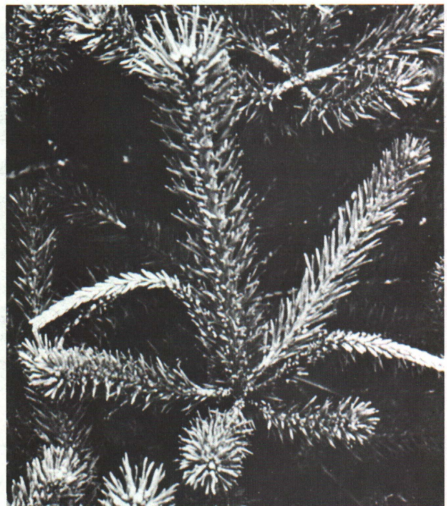
Figure 1. Eastern pineshoot borer injury on Scotch pine.

Preventing Damage: Although the injury caused by the eastern pineshoot borer is quite visible, the damage does not pose any problems to the vigor of the tree. Many attacks may damage the form of the tree, but the damage is minimal since the insect seldom attacks the terminal leader. The injured shoots will set buds and grow again the next growing season just as if the branch had been sheared. Bushiness will result, but this is desirable for Christmas trees. However, the injury is detrimental to the aesthetic value of the tree because the dead, brown branch tips are unattractive to Christmas tree buyers. The number of pineshoot borers can be reduced by normal shearing in June and early July