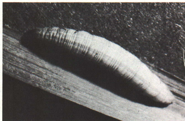
Fig. 2. Larva of the European skipper

PUPAE: Fully developed larvae fasten pieces of leaves or stems around themselves and pupate within this loose cover; however, some pupate without this covering. The spindle-shaped pupa is green, \frac{3}{4} of an inch long, with a double white stripe down its sides and a strong horn projecting forward from the head (Fig. 3). The pupal period usually lasts about 10 days; no feeding occurs during this life stage.