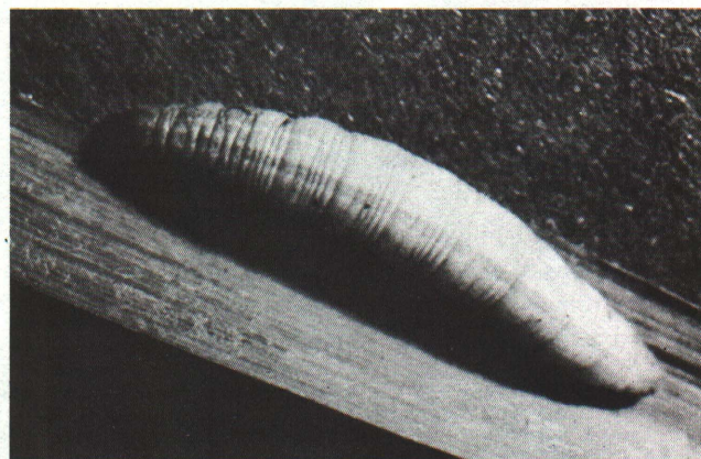
Fig. 2. Larva of the European skipper

PUPAE: Fully developed larvae fasten pieces of leaves or stems around themselves and pupate within this loose cover; however, some pupate without this covering. The spindle-shaped pupa is green, \frac{3}{4} of an inch long, with a double white stripe down its sides and a strong horn projecting forward from the head (Fig. 3). The pupal period usually lasts about 10 days; no feeding occurs during this life stage.