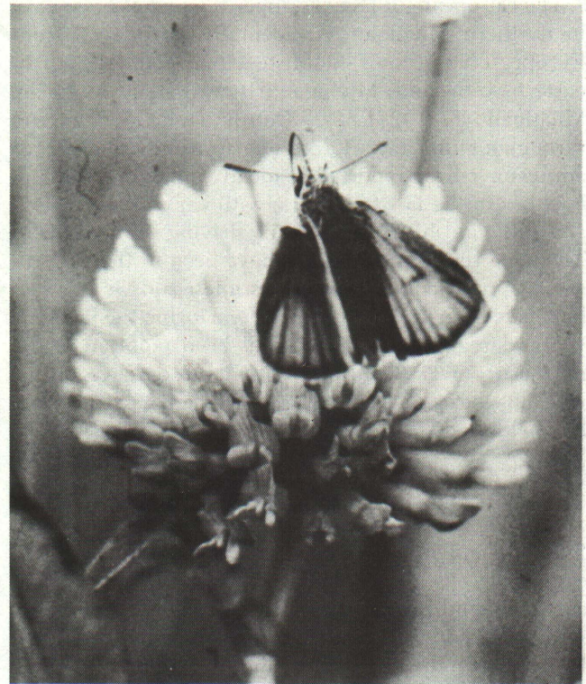
Fig. 4. Adult European skipper

An easy method to determine if a spray is needed is to count the number of larvae in a one-square-foot area within the field. Take two to three of these samples from each field. A spray is needed if six or more larvae are found per square foot.