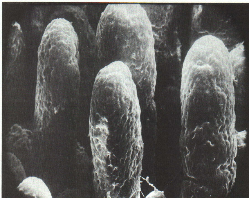
Figure 1. Scanning electron micrograph of normal small intestine, showing villi that line the intestine. These projections increase the surface area and are covered with the cells that digest and absorb nutrients from the feed. x200.

newborn pig are killed. The small intestine is now covered with immature cells that cannot function in digestion or absorption (Fig. 2).