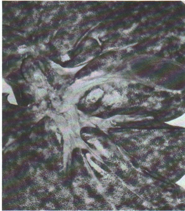
Figure 2. Damaged liver.