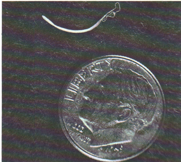
Figure 3. Adult whipworm ( Trichouris suis ).