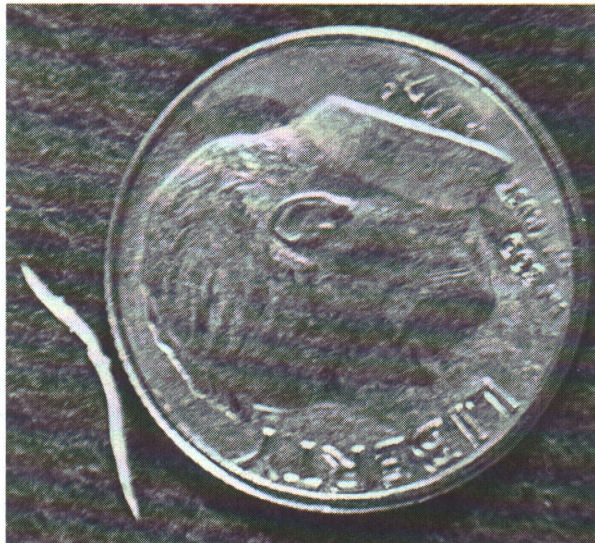
Figure 4. Nodular worm ( Oesophagostomum sp.).

tine wall into the bloodstream and are taken to the liver. The larvae migrate through the liver back into the bloodstream and end up in the lungs. They migrate from the lung tissue into the airways, travel up the trachea to the mouth, are swallowed, and develop into egg-laying adults in the small intestine. Since the entire life cycle from ingestion of the egg to egg laying requires about nine weeks, 8-week-old pigs may harbor immature worms but test negative on fecal examination.