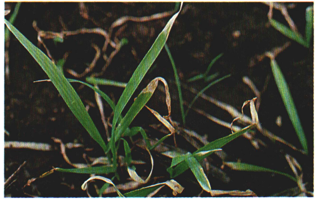
Atrazine injury on oats. Browning starts at the leaf tip and progresses towards the stem.

Soon after emergence, thin the beans to 3 plants per container by clipping. Thinning should be done as soon as possible after emergence to reduce the amount of herbicide removed by