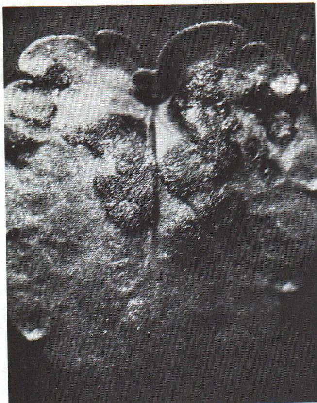
Fig. 3. Pansy leaf showing dark lesions due to powdery mildew infection.