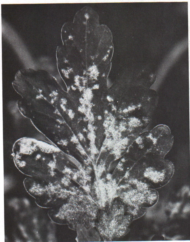
Fig. 2. Powdery mildew on greenhouse chrysanthemums.