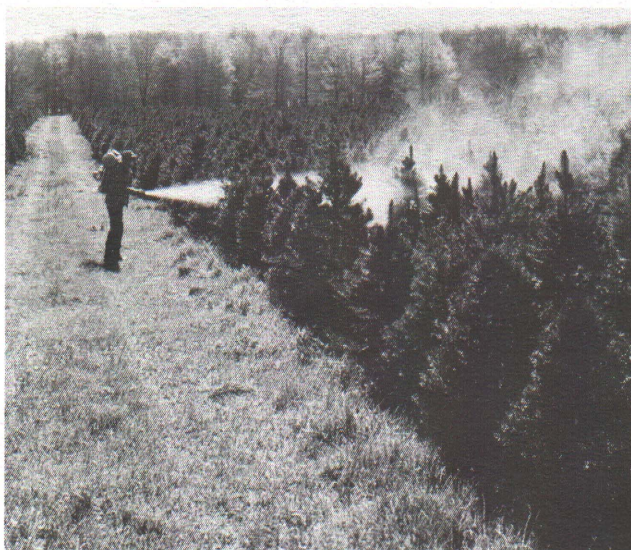
Chemical control of certain insects may be necessary to maintain quality foliage on Christmas trees.

Choose-and-cut operations are well suited for plantation locations near metropolitan areas. Success depends on a good selection of trees, advertising, adequate parking, ability to handle crowds and deal directly with people. Of all marketing methods, this can be most profitable and the only approach