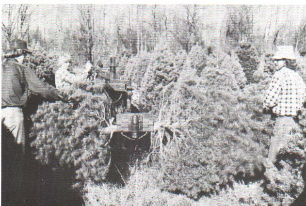
Some growers shake their trees to clean them of dead needles and other debris before baling for shipment and sale.

suitable for the part-time operator with a few acres of land. The land must be adjacent to the residence or full-time occupancy at the plantation site during the harvest period is essential.