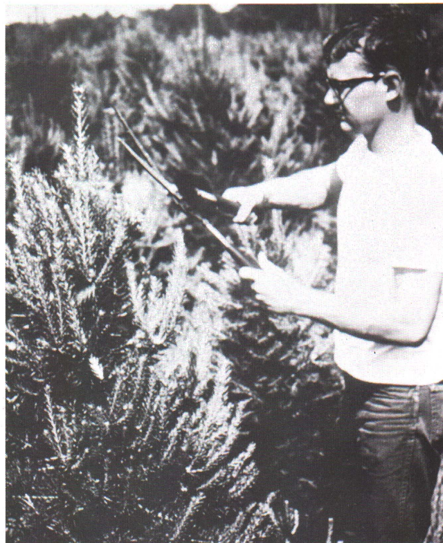
Annual shearing of individual trees beginning the third or fourth year following planting is required to produce quality trees.

knife, or hand or hedge clippers. The pruning knife does the best job, but it is not for amateurs or children. Adequate safety precautions should be taken including training and protective guards for hands and legs.