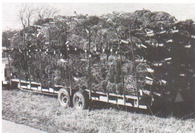
A load of quality trees ready for the retail market. Premium trees may be produced within 8 years from well managed plantations.

Using Scotch pine as an example and assuming an eight-year growth period to produce a 7 foot tree, the following costs are somewhat typical of what might be expected on a per-acre basis (1,000 trees actually planted). Because land ownership costs are highly variable and are incurred on owned land whether or not trees are planted, they are not included here.