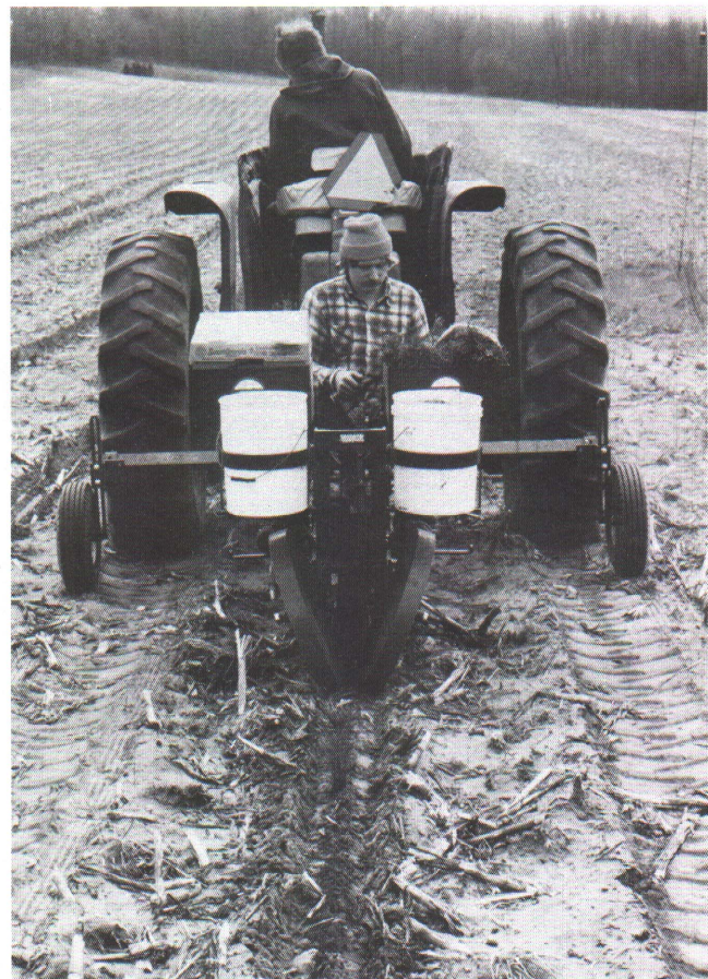
Machine planting is well suited for planting trees in larger open areas.

Nearly all plantings of Christmas trees are made in the spring. In the lower peninsula, planting may begin in late March, particularly on light, sandy soils. In the northern part of the state, planting often extends into May. If container-grown stock is to be used, planting may be completed later in the growing season.