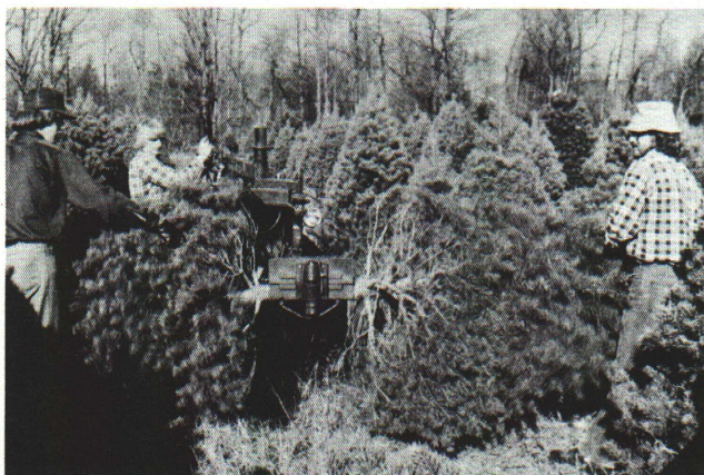
Some growers shake their trees to clean them of dead needles and other debris before baling for shipment and sale.

suitable for the part-time operator with a few acres of land. The land must be adjacent to the residence or full-time occupancy at the plantation site during the harvest period is essential.