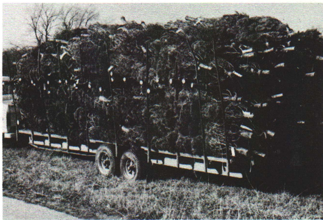
A load of quality trees ready for the retail market. Premium trees may be produced within 8 years from well managed plantations.

Using Scotch pine as an example and assuming an eight-year growth period to produce a 7 foot tree, the following costs are somewhat typical of what might be expected on a per-acre basis (1,000 trees actually planted). Because land ownership costs are highly variable and are incurred on owned land whether or not trees are planted, they are not included here.