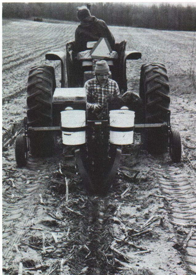
Machine planting is well suited for planting trees in larger open areas.

Nearly all plantings of Christmas trees are made in the spring. In the lower peninsula, planting may begin in late March, particularly on light, sandy soils. In the northern part of the state, planting often extends into May. If container-grown stock is to be used, planting may be made later in the growing season.