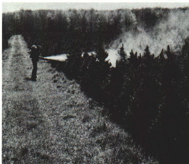
Chemical control of certain insects may be necessary to maintain quality foliage on Christmas trees.

Choose-and-cut operations are well suited for plantation locations near metropolitan areas. Success depends on a good selection of trees, advertising, adequate parking, ability to handle crowds and deal directly with people. Of all marketing methods, this can be most profitable and the only approach