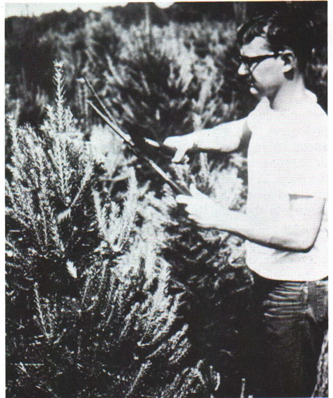
Annual shearing of individual trees beginning the third or fourth year following planting is required to produce quality trees.

knife, or hand or hedge clippers. The pruning knife does the best job, but it is not for amateurs or children. Adequate safety precautions should be taken including training and protective guards for hands and legs.