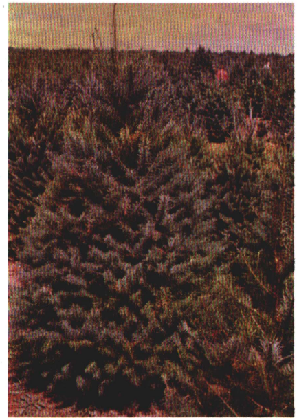
Douglas-fir, considered by many to be the premium Christmas tree species, is characterized by short, flexible needles which remain strongly attached to the twigs following cutting.

These suggestions for species selection do not preclude the use of other species. In fact, with few exceptions, nearly every conifer can be developed into an attractive Christmas tree, although not necessarily on a commercial level. The species recom-