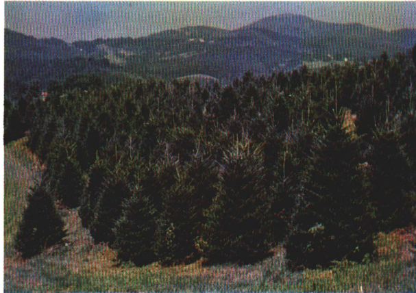
Fraser fir, a close relative to the native Balsam fir, has a pleasing natural shape and fragrance.

a pleasing fragrance. With some variation among species, they will do best on loamy soils. Growth rates are much slower than for pines, particularly during the first few years following planting.