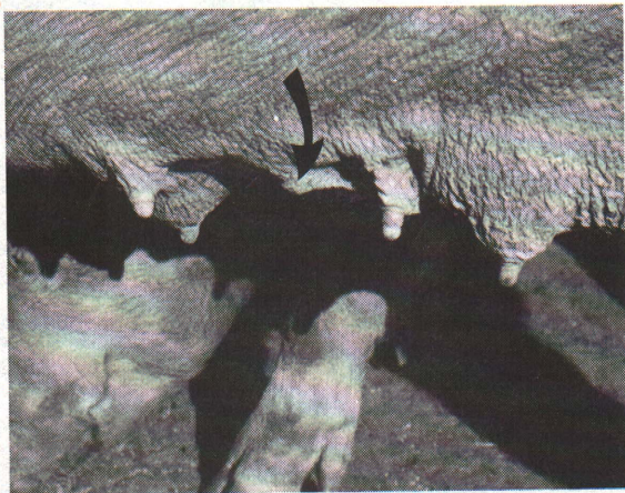
Figure 2. Non-functional teat caused by concrete burn during first week of life.

litters and allow age determination at the time gilts are evaluated and added to the breeding herd. Some producers have notched only gilts from large litters, using birth date as the number so the age can be determined. Ear tags are helpful in identifying sows in the breeding herd (Fig. 3). Sufficient sow identification and farrowing house records need to be kept in order to cull the right sows.