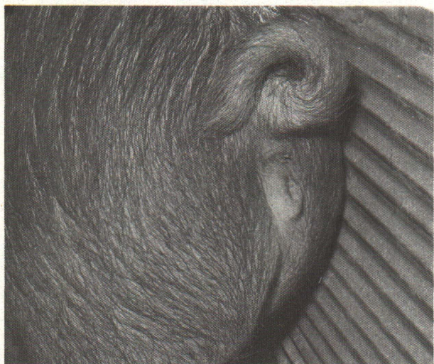
Figure 1. Select gilts with normally developed external genitalia (top). Gilts with small infantile (center) or abnormal (bottom) vulvas should not be kept.

means being free of flaws or defects which would interfere with normal reproductive and maternal functions. Three areas are of particular concern: (1) reproductive; (2) mammary; and (3) skeletal. For selection as replacement stock, sows and gilts should meet minimal levels in each of these categories.