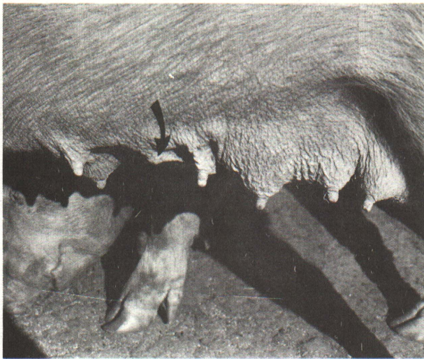
Figure 2. Non-functional teat caused by concrete burn during first week of life.

Reproductive soundness —Replacement gilts should exhibit normal reproductive development, both anatomically and behaviorally. The external genitalia should be normally developed (Fig. 1).