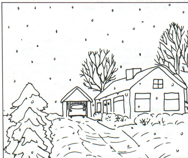
Fig. 2, b) Constricted space can cause additional energy use in winter.

Habits must change if we are to conserve our limited energy and natural resources. Homeowners must forego the use of scattered plantings, small insignificant grassed areas, and landscape accessories having a petroleum origin. Plantings can and must be arranged to help reduce heating and cooling costs, and yards can incorporate low-maintenance practices or even a "back-to-nature" stance where practical. Rewards for this logical and constructive attitude will be great, including more seclusion, lower energy demands and greater ecological harmony.