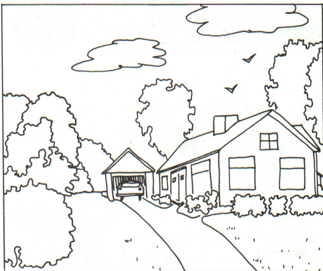
Fig. 2, a) Generous open space gives summer comfort.

Power equipment used in landscape maintenance may be restricted if fossil energy and its derivatives are in short supply. To overcome the "power tool habit" we have to find new ways to cooperate with nature. Although Americans seem to have a "Green Grass Ethic," there are many places where energy-gulping grass mowing could be eliminated by replacing the grass artistically with uniform height ground covers. Many of these common