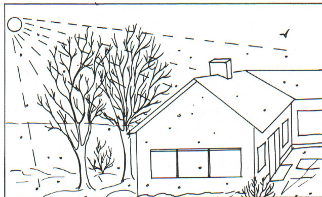
Fig. 1, b) Solar heat penetration during winter.