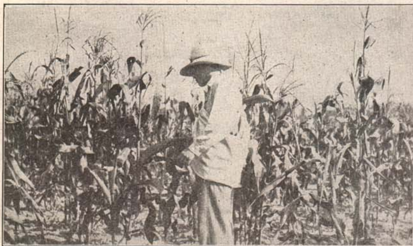
Good seed corn can only be secured by selecting in the field from standing stalks, drying immediately and storing properly.

Enter field of standing corn carrying sack or basket, husk and pluck for seed: Mature, well filled ears; Borne on vigorous plants; Growing under average field conditions.