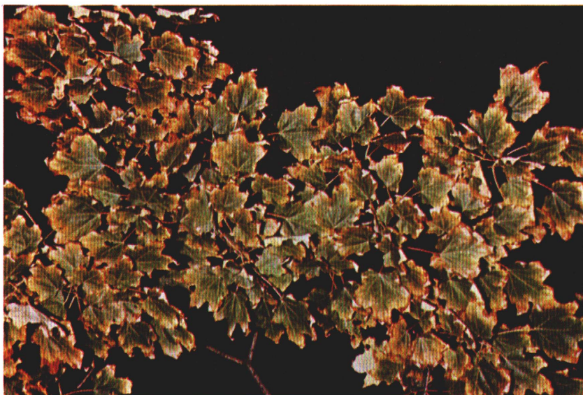
Fig. 7—Symptoms of scorch on maple. Note all the yellowing and browning is restricted to leaf margins or interveinal areas.