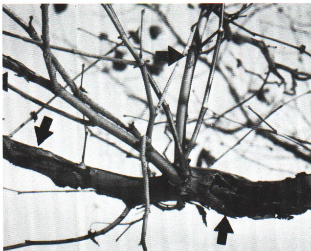
Fig. 1—Old and new cankers (arrows) caused by the invasion of twigs by the sycamore anthracnose fungus. Also, note the black specks on some twigs where the fungus has formed fruiting structures.

Causal agent and disease cycle —Anthracnose of the trees mentioned above is caused by several species of