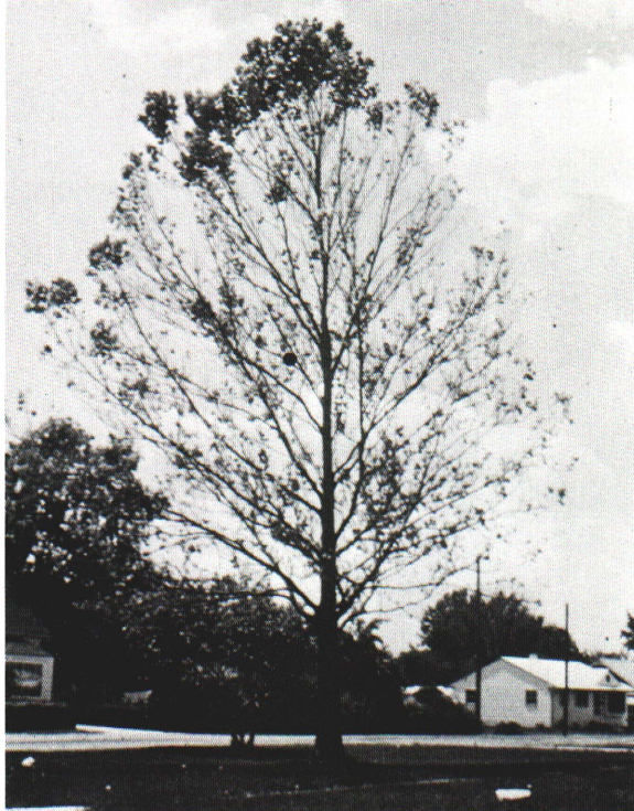
Fig. 5—Anthracnose caused defoliation of sycamore. Tufts of leaves left at ends of branches have escaped infection.