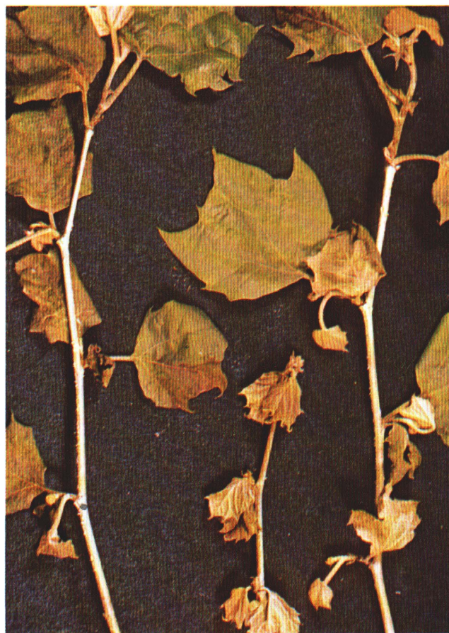
Fig. 3 —Leaf and twig blight stage (sycamore). Note first crop of leaves (small, dry) was killed by anthracnose. Some second crop leaves (larger) have also been killed; some, however, are only partially diseased or have escaped injury.

On the other hand, trees which are well maintained and fertilized at regular intervals (see MSU bulletin E-796) may lose the first crop of leaves in spring, but regrowth is so vigorous that by early summer there is little difference between sprayed only and fertilized only trees, with a substantial saving in dollars. Therefore, we recommend that established plantings of anthracnose-susceptible trees be placed on regular maintenance and fertilizer programs and that spray programs as mentioned above for young trees be restricted to only those established trees that are located in aesthetically critical settings.