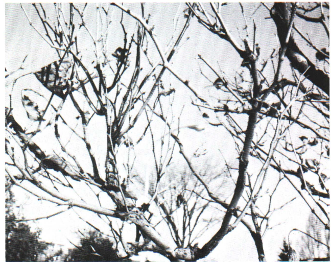
Fig. 2—Bird's nest branching in sycamore. This condition is caused when a growing tip is blighted as in Figure 3, and the host produces several lateral shoots in response to this loss.