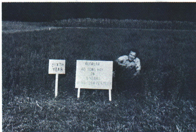
Figure 1. Nearly 8 tons hay per year for 6 years. Excellent varieties, four cuttings per year, good seedlings, and excellent soil with good tile drainage, pH of 6.8, 700 lb. of 0-14-42 per year, and weevil control contributed to the high yield.

5. Three cuttings instead of two in southern Michigan, the first in late May or early June, the second when starting to flower, the third any time when flowering starts in late summer or fall. Or, get an extra ton by taking the fourth cutting for silage or green chop in