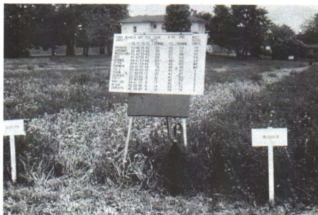
Figure 2. Wilt resistant Iroquois (right) has an excellent stand in the fifth year at the Kellogg Farm near Battle Creek but wilt susceptible DuPuits (left) is nearly 100% invaded by dandelions.

The alfalfa weevil ( Hypera postica ), Michigan's most serious insect pest, can generally be controlled when infestation will likely reduce yields by spraying with ap-