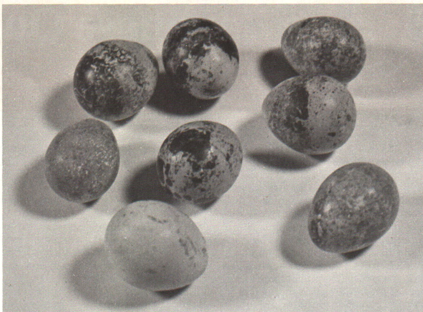
Fig. 2—Japanese quail eggs.

Domesticated quail do not have the tendency of broodiness, and hence, eggs must be incubated under a