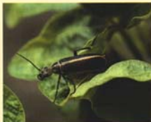
Margined blister beetle

Blister beetles (four types: striped, black, ash gray, margined) Blister beetles produce a toxic compound, cantharadin. Consuming as few as 12 beetles, even if they are killed or smashed during the hay-making process, can kill a horse. The beetle is rarely present in first cutting alfalfa. Subsequent cuttings should be made before bloom since the insect is attracted to flowering alfalfa. Blister beetles are more commonly found in hay produced in the southern United States and in periods of drought when grasshoppers are present.