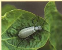
Ash gray blister beetle