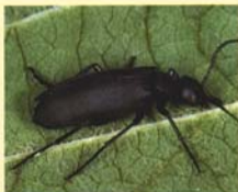
Black blister beetle

Nitrates , high levels in hay or pasture High levels of nitrates may cause death. Symptoms include increased salivation, labored breathing, unco-ordination, weak pulse, muscle tremors, vomiting, diarrhea, and sulfocation. A characteristic finding is the chocolate discoloration of the blood and blueness of membranes. Some weeds—pigweed, lambsquarter, and nightshade—naturally accumulate nitrates. Grasses heavily fertilized with nitrogen (including manure) or produced under drought conditions may have toxic levels of nitrate and should be tested prior to feeding. If in doubt, have hay tested at any forage testing laboratory.