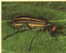
Striped blister beetle