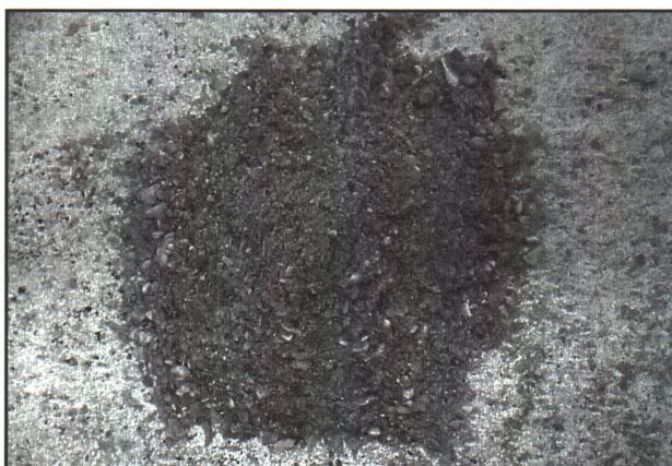
Figure 5b. This sample has a particle size of approximately 700 microns.

On the other hand, formulating diets with ingredients with a high fiber content can result in increased feed consumption and more opportunity for the production of feed waste. Generally, diets high in fiber are low in energy density. Therefore, pigs need to consume more feed to meet their energy requirements and will spend more time at the feeder. More time at feeders can equate to increased opportunity for wasting feed. However, because there may be cost advantages to using diets higher in fiber, producers should weigh the potential economic benefits of feeding fiber with the possibility of increased feed waste. Improving feed costs only to waste more feed may not be advantageous.