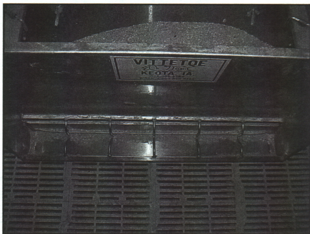
Figure 4. Feeders should be adjusted so that less than one half of the trough bottom has feed exposed.

reduction in total time at the feeder (2) .