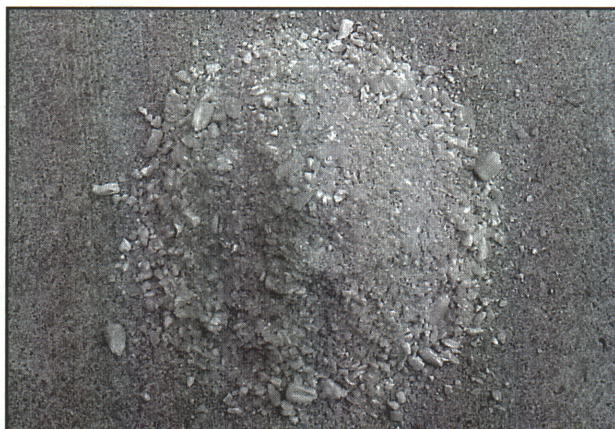
Figure 5a. This sample has a particle size over 1,000 microns.

swine diets to decrease the amount of feed necessary for pigs to consume in order to meet their requirements is an effective way to reduce feed waste. Adding fat to diets is one way of increasing the energy density of diets and improving feed efficiency and reducing feed waste. For each 1% of fat added to a grower/finisher diet, feed efficiency will be improved by approximately 2%. Fat additions can also reduce the formation of dust, which is another source of feed waste. Many producers routinely add fat at 1% of the ration to reduce dust.