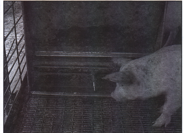
Figure 3. Using wet/dry feeders can reduce feed and water waste.

Select a feeder that is designed to reduce waste. Feeders that allow pigs to eat upright while standing at the feeder will reduce waste by preventing the pig from backing out of the feeder to eat in a natural upright position. The lip on a feeder should be high enough to restrict spilling but not more than 8 inches. Lip heights greater than 8 inches result in pigs stepping into the feeder and wasting feed. Because eating a dry feed necessitates drinking, feeders that combine a water supply with the feeder such as wet/dry feeders (Figure 3) reduce the need for pigs to walk away from the feeder to get water. Locating a water source near the feeder can also reduce feed waste by minimizing movement.