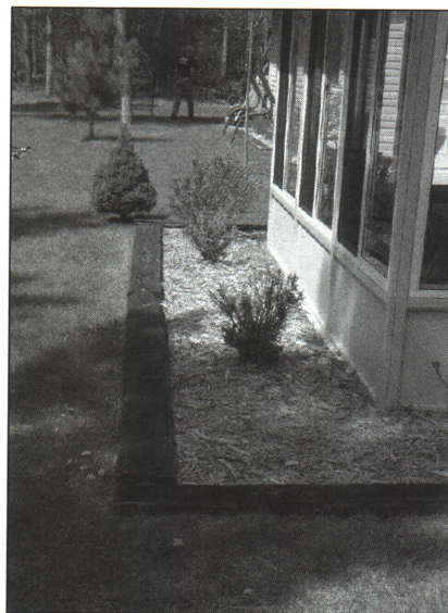
Figure 2. Flammable mulches and evergreen shrubs can burn intensely.

The most important line of defense is a 3-foot-wide ring around your home, attached garage, and any attached porches or decks in which there is no burnable vegetation or ground cover. It is not only the flames from a wildfire that can ignite your home — it is also (and perhaps more importantly) the “ember blizzard” that is usually associated with a wildfire. These burning embers, blown by the wind ahead of the main fire, can land in and ignite dead leaves, wood chips and other flammable material next to the structure.