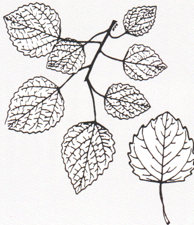
BIG-TOOTH ASPEN ( Populus grandidentata ). Similar to trembling Aspen, except leaf has large, coarse margin. Leaf stem, also flat which causes quaking in a breeze. Tree bark is more yellowish in color than trembling Aspen. Best of the aspens for lumber and pulpwood.