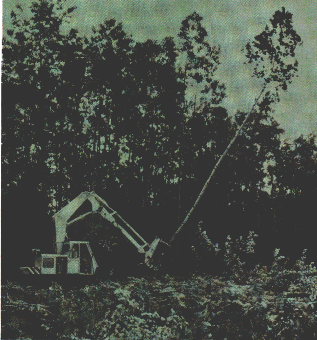
Figure 2. Mechanized harvesting is an economically feasible and desirable alternative to traditional methods.