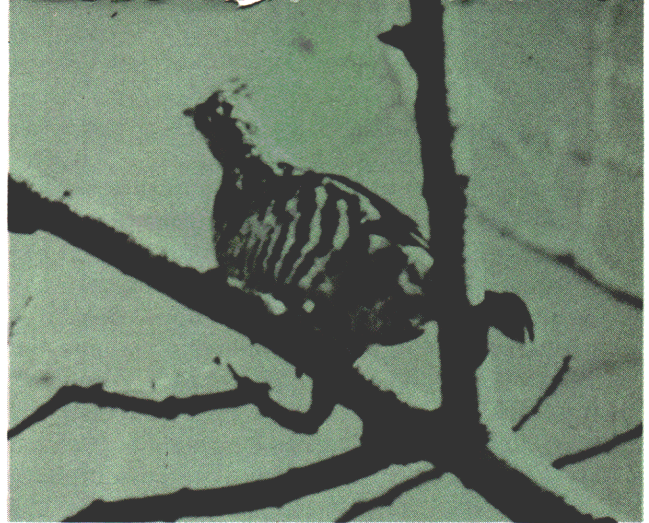
Figure 3. Excellent grouse habitat results from small clearcuts in aspen stands.

The objectives of producing both timber and wildlife in aspen stands are fully compatible. Clear-cutting, which is necessary to reproduce aspen, results in highly desirable habitat for deer and grouse. When timber and wildlife objectives are equally important to the landowner, consider clear-cutting several small, well-dispersed areas each year. This will produce vigorous aspen stands with a wide range in age. Furthermore, harvest ages