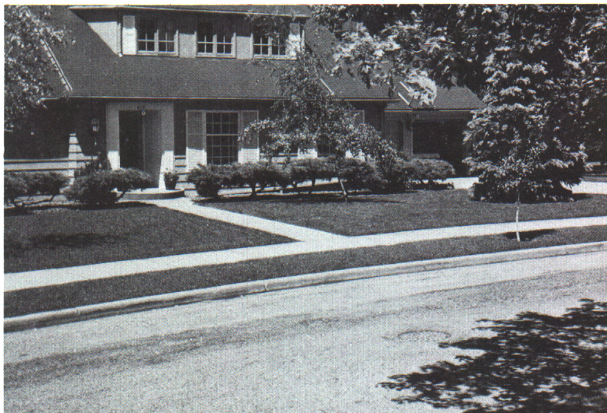
Kentucky bluegrass is a popular choice for lawns in Michigan.

Bluegrass cultivars are often placed in one of two categories: (1) improved, or (2) common. Improved cultivars have greater disease resistance and vigor, and can provide a thick, beautiful lawn if well maintained. Common cultivars possess less disease resistance,