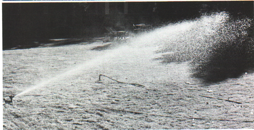
Two types of sprinklers that can be attached to a hose are the oscillator type (top) and the rotary impact (bot.).

water and equipment must be considered. The following guidelines will help to maintain a desirable lawn quality, and avoid wasting water.