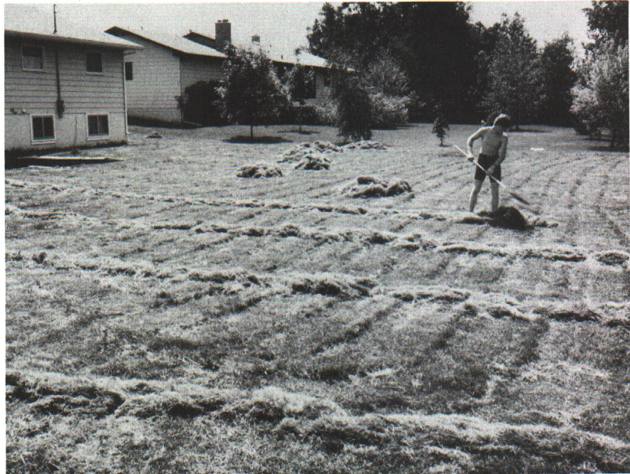
Infrequent mowing shocks the grass and leaves excessive clippings that must be removed.

The turfgrass species and cultivars growing in the area are the most important factors to consider when selecting the height of cut. For example, creeping bentgrass has many of its leaves oriented horizontally. At low heights of cut (under 1/2 inch) creeping bentgrass produces adequate leaf tissue to support the rest of the plant. This allows for shorter mowing such as practiced on a golf green. Kentucky bluegrass, fine-leaved fescues, and improved perennial ryegrasses have a more upright growth habit. These lawngrasses should be cut between 1 1/2 and 2 1/2 inches for maximum health of the grass plants.