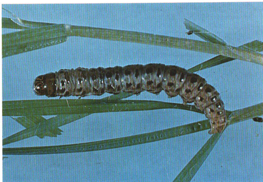
Fig. 2. Sod webworm larva.