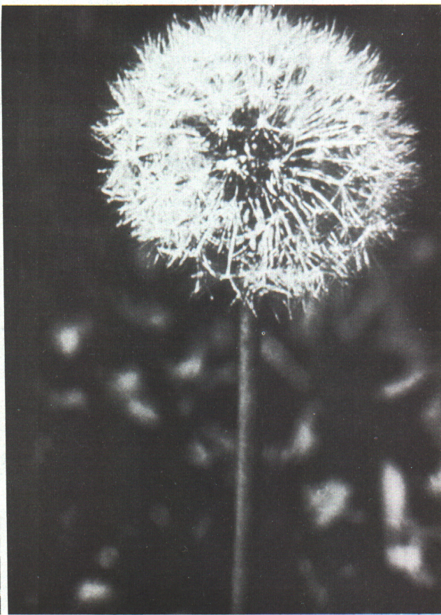
Dandelion in bloom (left), and in seed production stage (right).

Dandelion is a very common and familiar weed found in Michigan lawns. It is a cool season perennial, flowering from early spring to fall, although the yellow dandelion flowers are most abundant in April and May. The plants have a thick, fleshy taproot, often branched, which can penetrate several feet