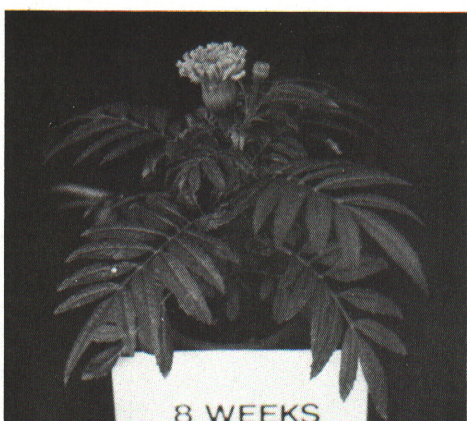
Eight weeks after transplant.