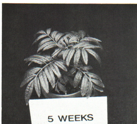
Five weeks after transplant.