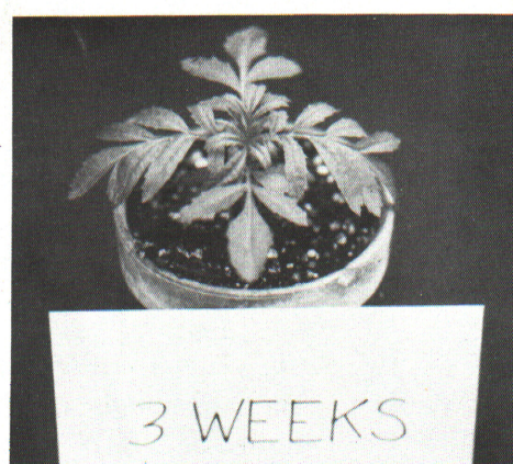
Three weeks after transplant.