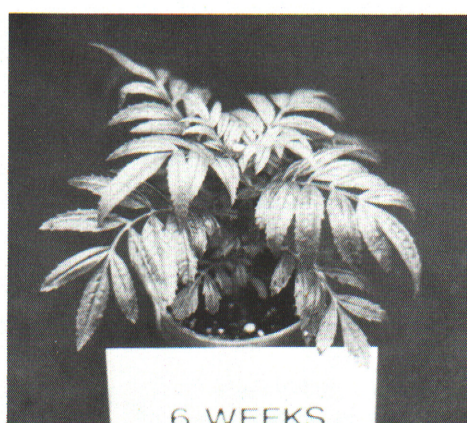
Six weeks after transplant.