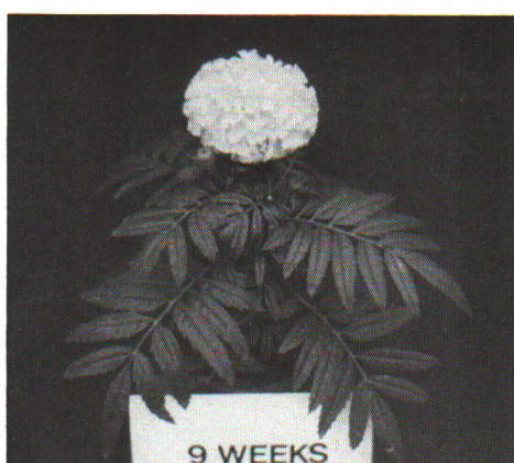
Nine weeks after transplant or 10 weeks from seeding (70 day old plant).