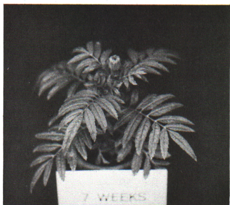
Seven weeks after transplant.