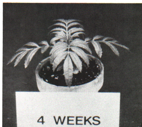
Four weeks after transplant.