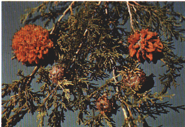
Figure 1. Galls on juniper with and without tendrils (telial horns).