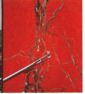
3. Soybean cyst nematode. L, field damage; R, cysts on roots