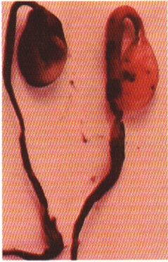
1. Pythium seedling rot