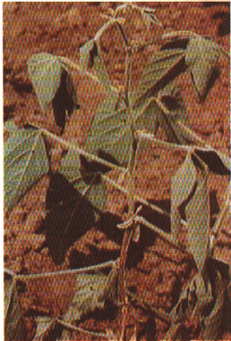
4. Phytophthora root and stem rot