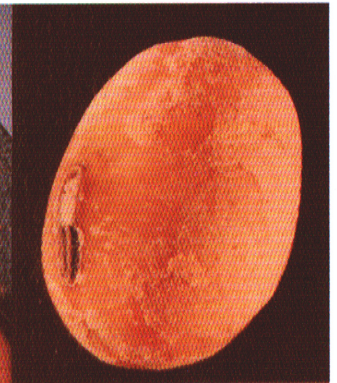
13. Downy mildew. L, upper and C, lower leaf surface; R, infected seed