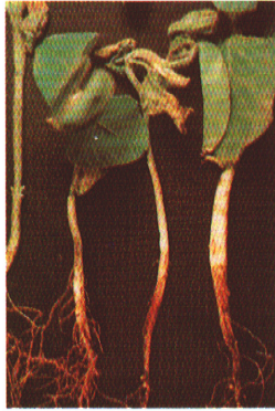
2. Rhizoctonia root rot