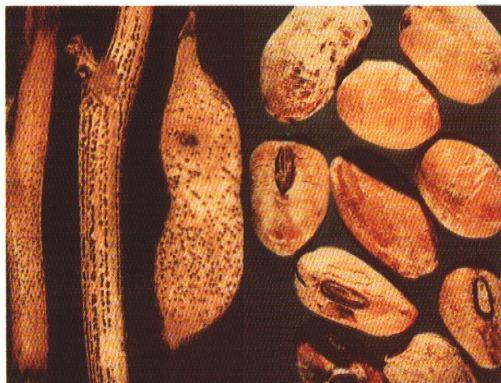
12. Pod and stem blight. L, pycnidia on stems and pod; R, infected seed