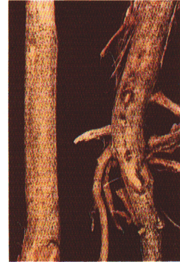
6. Charcoal rot