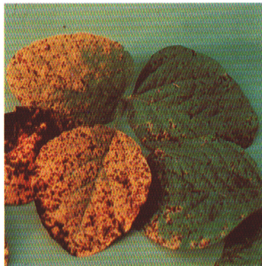
9. Septoria brown spot