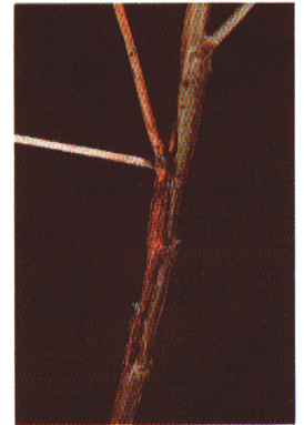
11. Stem canker