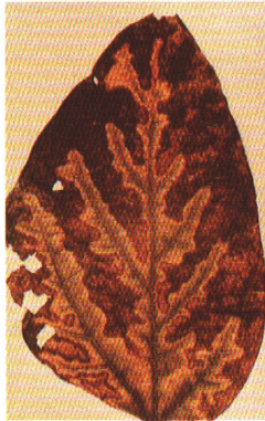
5. Brown stem rot