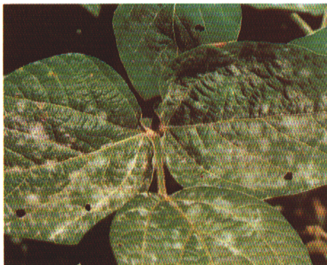
8. Powdery mildew